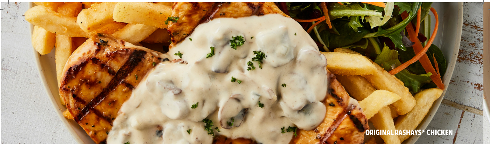
ORIGINAL RASHAYS® CHICKEN