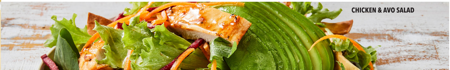
CHICKEN & AVO SALAD