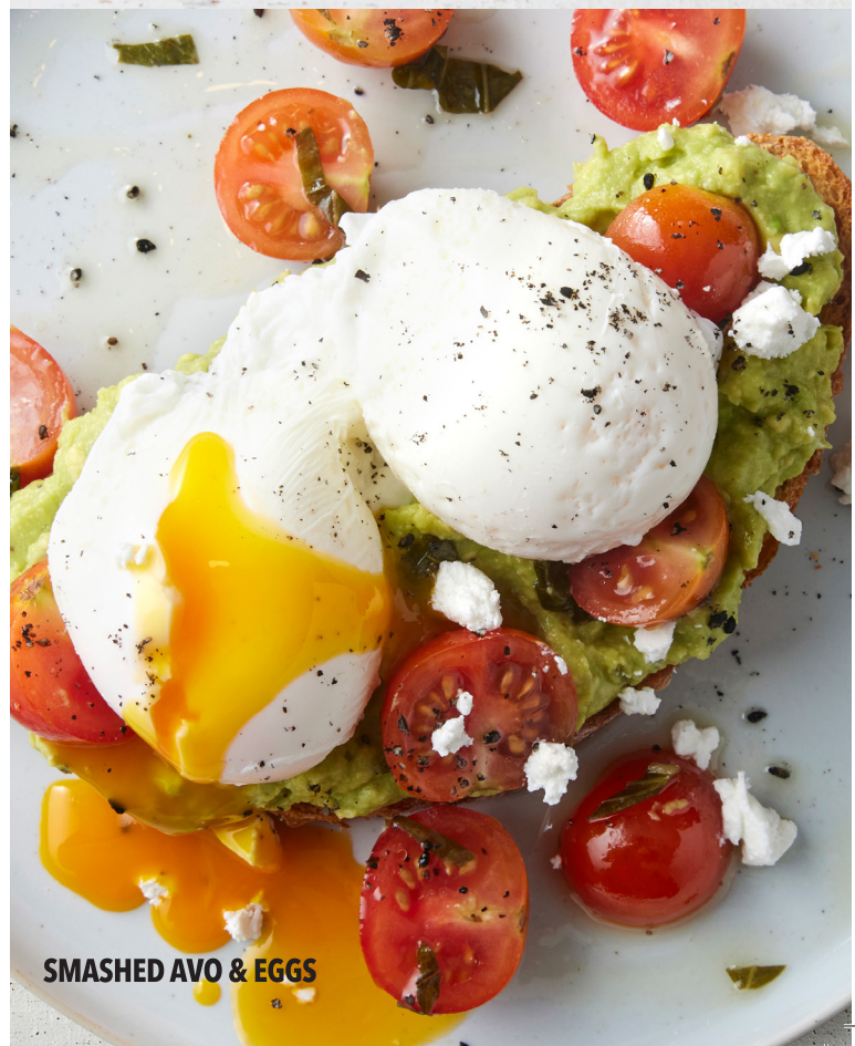
SMASHED AVO & EGGS