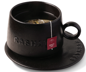
LOOSE LEAF TEABAG