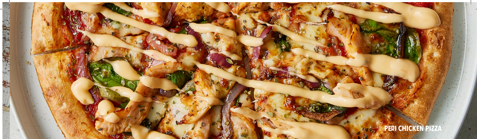
PERI CHICKEN PIZZA